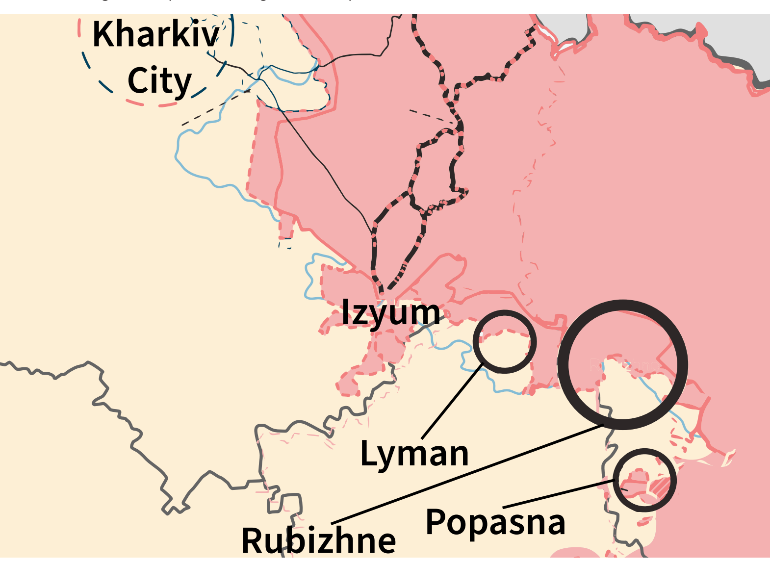
Figure 6: Map of Kharkiv Region on 16 May