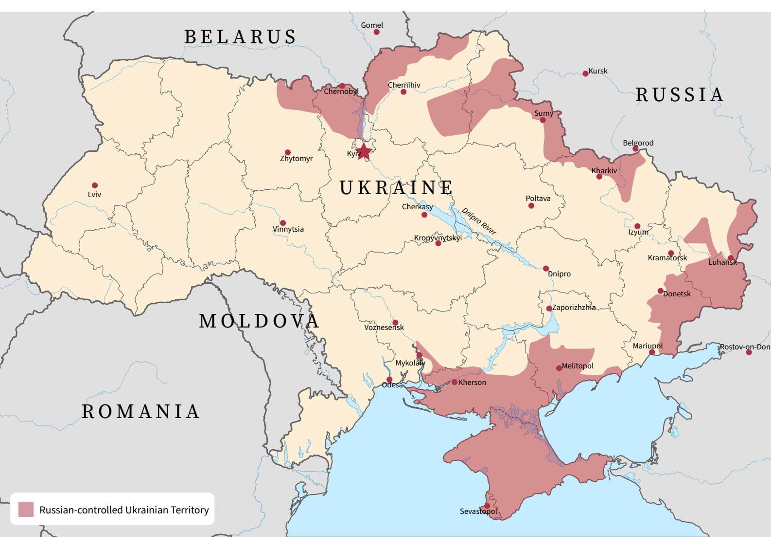
Figure 3: Map of Ukraine on 27 February

time to coordinate the activity of tactical units led many units to move along the same roads, rapidly becoming intermingled, choking up key junctions and slowing down the rate of advance.