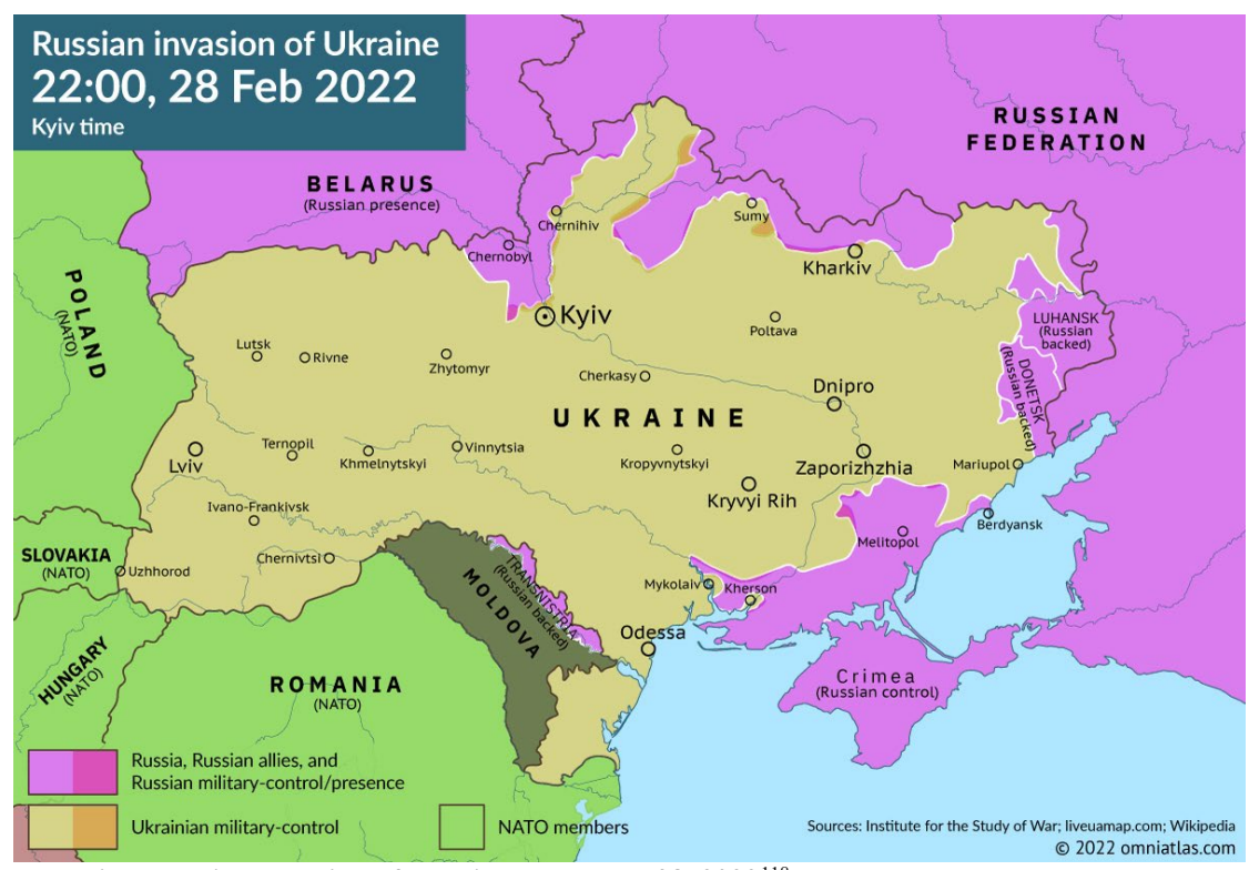
Map Five: Russian Invasion of Ukraine: February 28, 2022<sup>118</sup>

• Russian forces occupied Berdyansk between Melitopol and Mariupol. Mariupol was effectively enclosed on both sides.