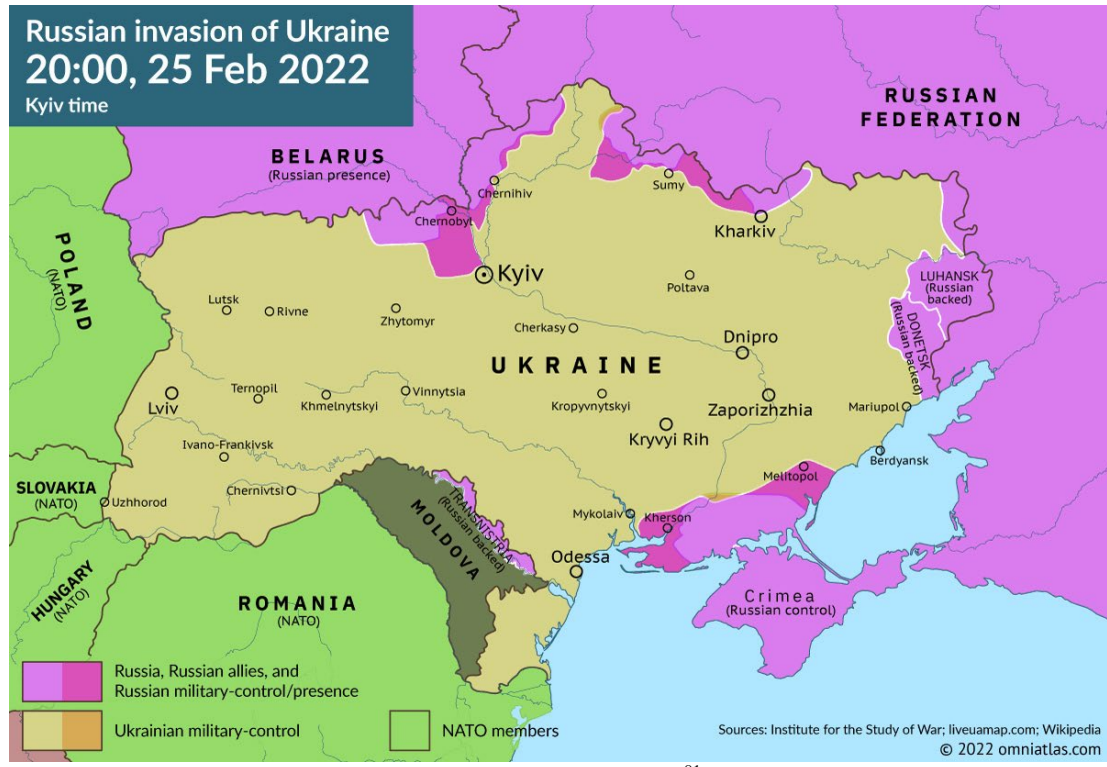
Map Two: Russian Invasion of Ukraine: February 25, 202281