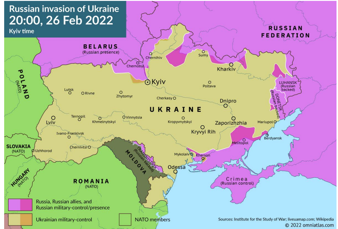
Map Three: Russian Invasion of Ukraine: February 26, 202299